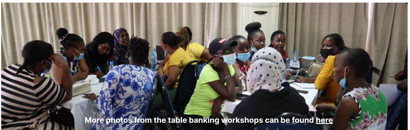
More photos from the table banking workshops can be found here