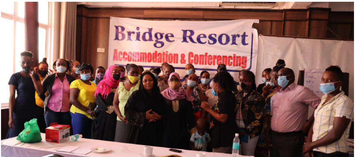
More photos from the workshop can be found here

The workshop was discussed and agreed upon during the WIT needs assessment in Mombasa. Flone organized this workshop that brought together 37 women. The workshop identified that women continued to suffer immensely, with some lacking the autonomy to make informed decisions regarding their sexual reproductive health in public spaces and households. While working, women leave their children under the watch of their neighbors, family, or domestic workers hence it proves difficult to identify when the children are violated. With the majority of the women being rendered jobless and forced to stay at home, they lacked a platform to share their experiences. Nationally, most government offices were operating remotely, making it hard for the women to access psychosocial and legal services regarding SRHR violations. The training workshop provided more information on different forms of harassment at the workplace and at the household, where to report, and the procedures for handling sexual and gender-based violence cases at the family and workplace. They were furnished with toll-free hotlines to access psychosocial support while at work or home. The trained women were commissioned to be SRHR goodwill ambassadors to young girls and fellow women at the grassroots level.