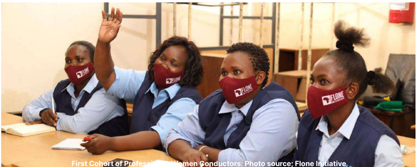
First Cohort of Professional Women Conductors: Photo source; Flone Initiative

Photos of the project can be found below: